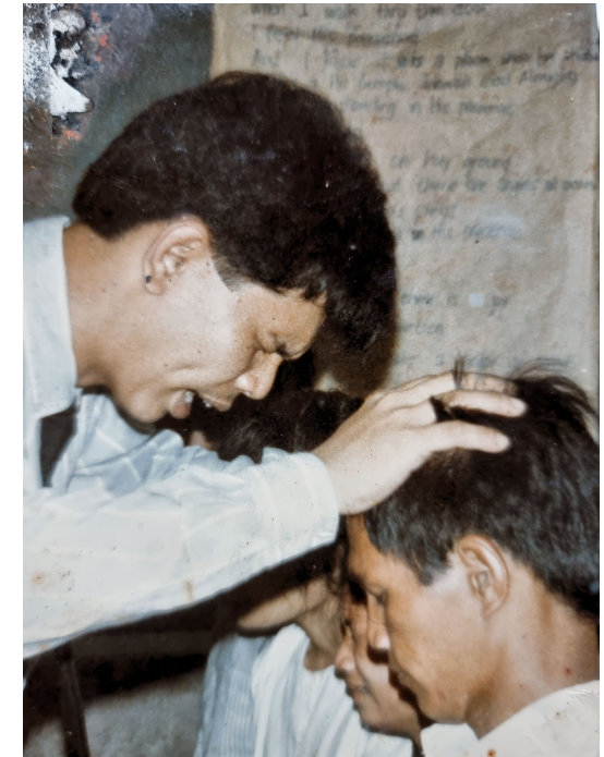
Laying hands during an altar call.