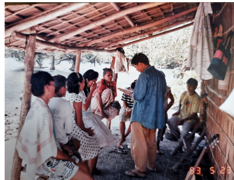
Preaching under a wooden hut.